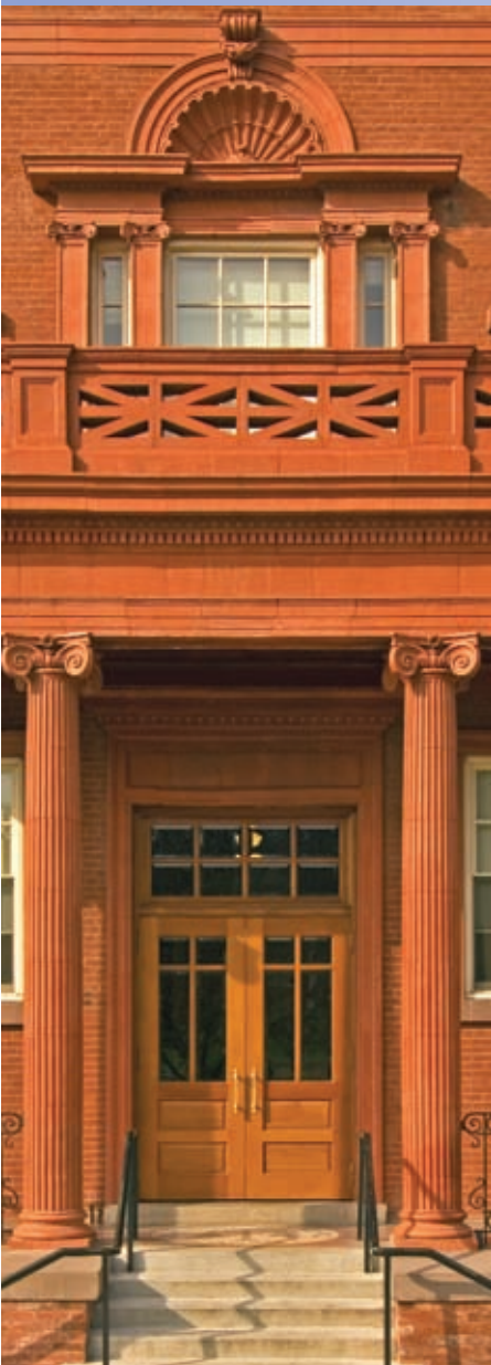
Thurgood Marshall Academy – Anacostia