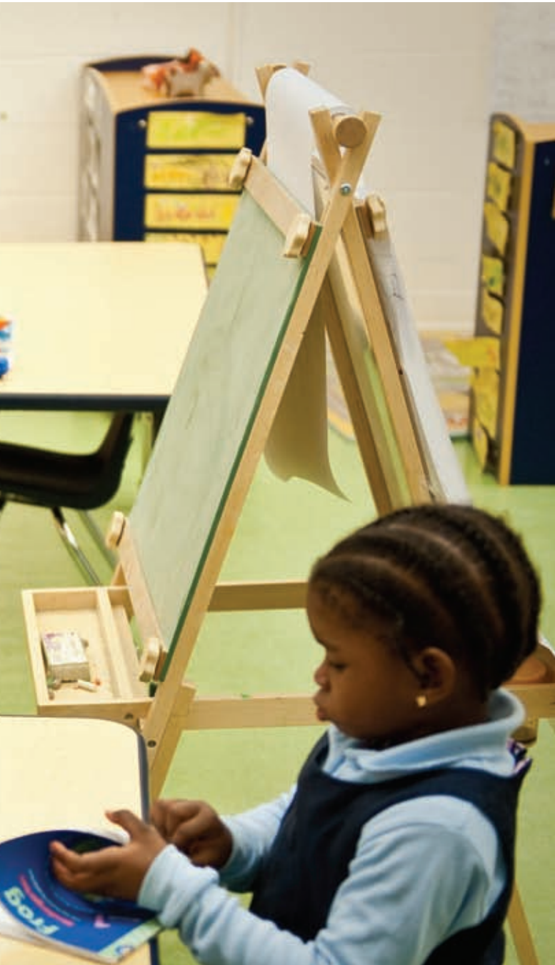
DC Prep Public Charter School

City First values partnerships. We specialize in collaborating with alternative sources of financing and credit enhancement such as nonprofits and local governments. This was the case when the bank teamed with the District of Columbia and Building Hope, a nonprofit that provides technical and financial assistance to charter schools. The partnership allowed City First to finance the renovation of two former public schools for use as incubators for early stage charter schools. Because the school buildings are publicly owned, they were not available to be pledged as collateral. To overcome this obstacle, the parties collaborated to identify alternative collateral in the form of a federal grant administered by the District. With the help of this creative financing and an accelerated renovation schedule managed by Building Hope, the schools were delivered in time for the opening of the 2008-09 school year. Draper Elementary became the home of Achievement Prep and Benning Elementary now houses DC Prep and NIA Public Charter Schools. Together the buildings account for 120,000 square feet and support 407 students.