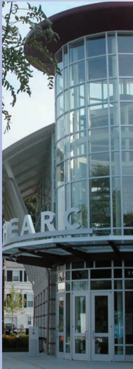
THEARC – Washington, DC