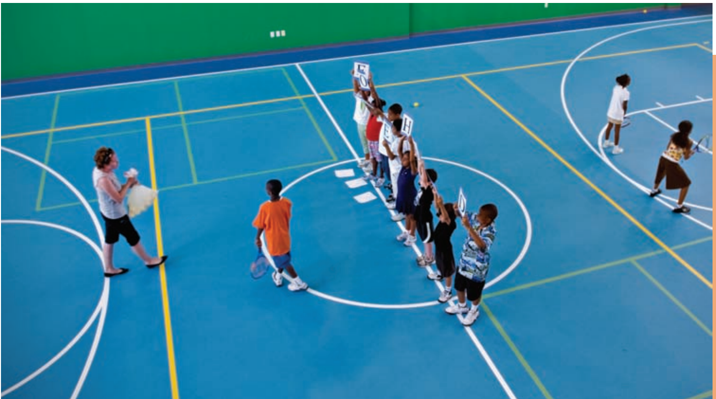
E. L. Haynes Public Charter School

The impact of our NMTC financing has been phenomenal. Because of the scale and scope of the projects, these deals have transformed their communities. In aggregate, NMTC financed projects created 1,017 construction jobs, retained 439 existing jobs, and created 289 new jobs. The financing resulted in the development of 116 units of for-sale housing – of which 98 were affordable for low to moderate income buyers – and 117 units of rental housing. A total of 2.046 million square feet of real estate has been financed.