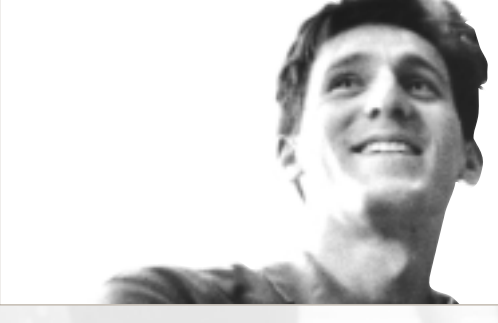
2000 Annual Report