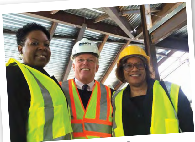
Mamie D Lee School Topping Ceremony Transforming Education