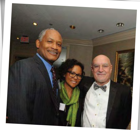
Diversity Reception at the Willard Coalition Building