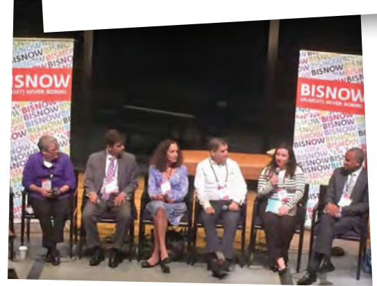
Bisnow Affordable Housing Conference Sharing the Stage with our Partners