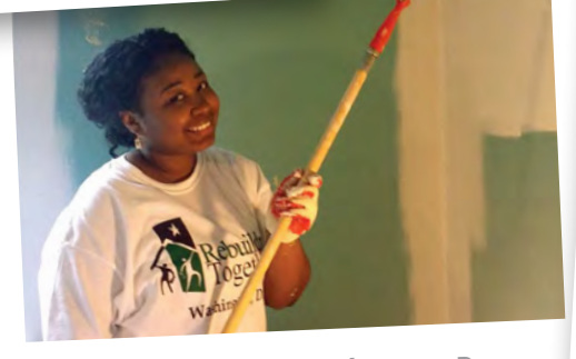
Rebuilding Together Volunteer Day Serving our Communities